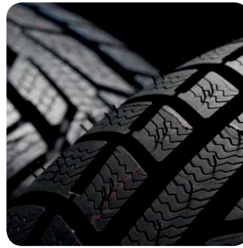
the minispec Cross Link Density Analysis