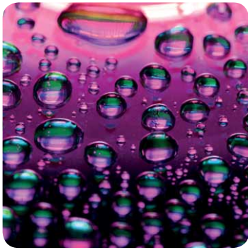
the minispec Droplet Size Analysis